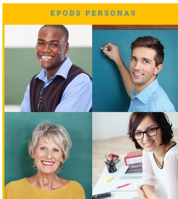
The 4 EPODS Personas. More details in Joint User Needs Analysis, www.secondchanceeducation.eu/materials

EPODS recognises that the segment of educators who could benefit most are the younger, less experienced teachers i.e. the new NOAHS and the average ALEXs. Both Personas identified a gap in the existing provision of CPD, and are perhaps more likely to engage in online learning and make use of the online CPD service, due to a higher digital confidence. So: which Persona are you?