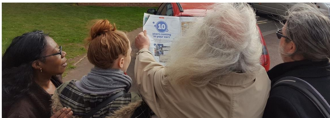
EPODS team members outside BCFM radio station, Bristol, UK

A successful meeting was held in Bristol, UK, in March 2017 hosted by partner Phoenix Social Enterprises . We seized the opportunity to spread the EPODS message via local Bristol radio station BCFM (listen to the interview here ), and enjoyed the sights, smells